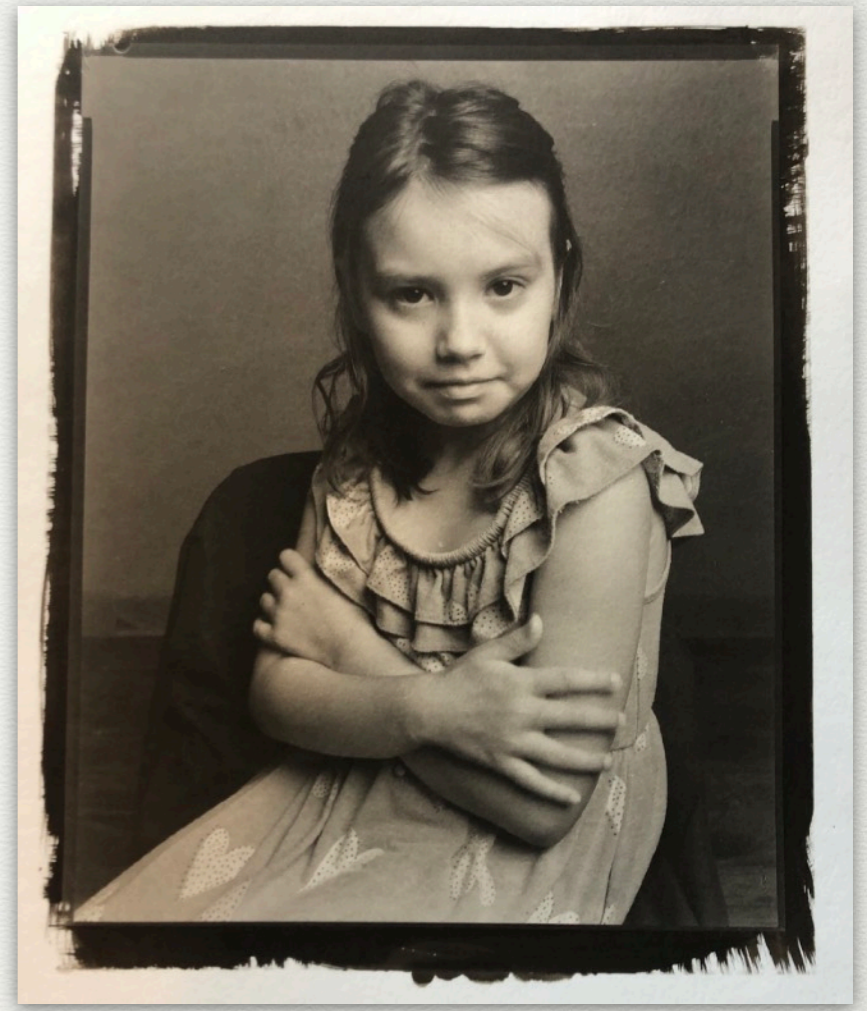
Platinum & Palladium