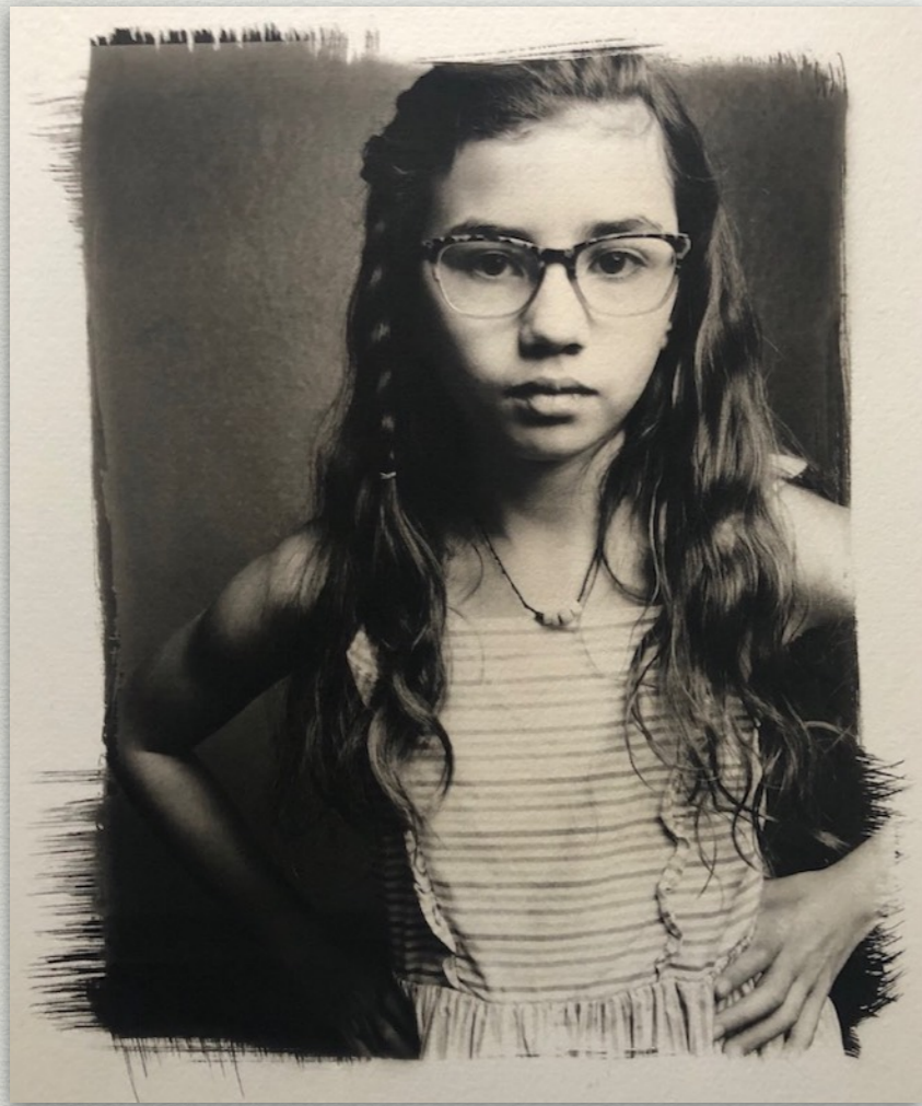
Platinum & Palladium